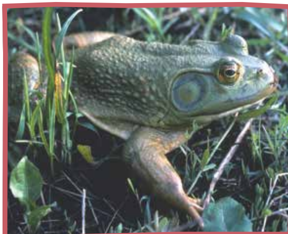
Bull frog — Allen Blake Sheldon

In the floor of the Reserve valley, the Kickapoo River floodplain features a rich mosaic of wetland habitats. Sedge meadow and marsh habitats characterize river meanders and old river oxbows. Flanking the river channel is floodplain forest dominated by silver maple, green ash, and American elm; shrub carr is also present. Groundwater seepages are commonly associated with bedrock outcroppings on the valley hillslopes, and support a number of rare plants. More than 25 rare plant species have been documented at the Reserve.