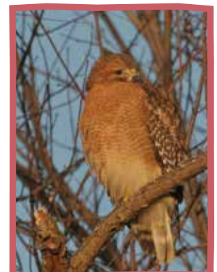
Red-shouldered hawk