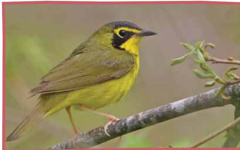
Kentucky warbler

Visit the Wisconsin State Natural Areas Program website: dnr.wi.gov/org/land/er/sna .