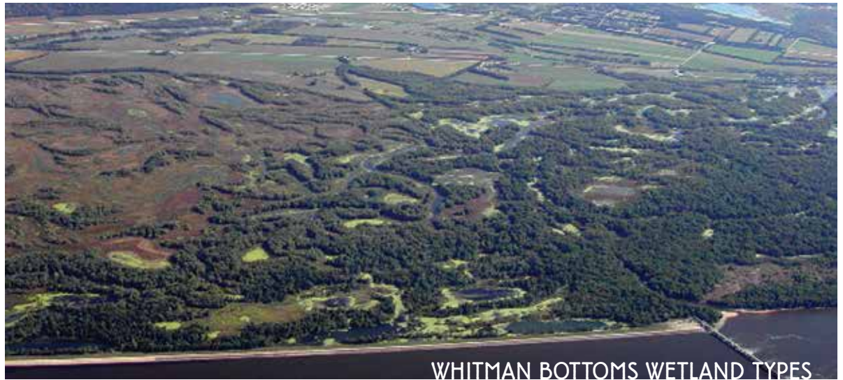
WHITMAN BOTTOMS WETLAND TYPES