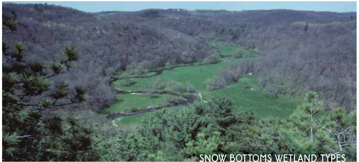
SNOW BOTTOMS WETLAND TYPES

Fen, forested seep, shrub carr, alder thicket