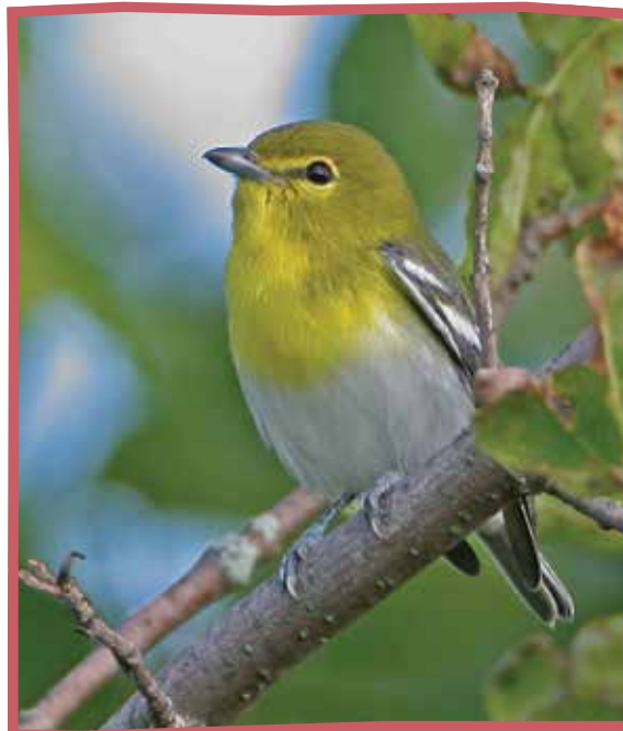
Yellow-throated vireo — Scott Franke

This Driftless Area Wetland Gem features an extraordinarily scenic valley with the meandering Blue River flanked by fens, forested seeps and other wetland habitats. Sandstone cliffs bound the valley and hold snow in the bottoms well into the spring, giving the site its name. The Blue River and its tributaries are high quality trout waters that flow into the Wisconsin River in northeast Grant County. While the valley is perhaps better known for its geological formations and upland habitats, including the most significant remaining pine relicts in Wisconsin, the valley's wetlands are also significant because calcareous fens are uncommon in this region of the state. With a mosaic of high quality wetland and upland habitats, Snow Bottoms supports many rare species and diverse wildlife. WDNR plans to expand protection efforts in the valley to preserve these native plant communities and water quality in the Blue River system.