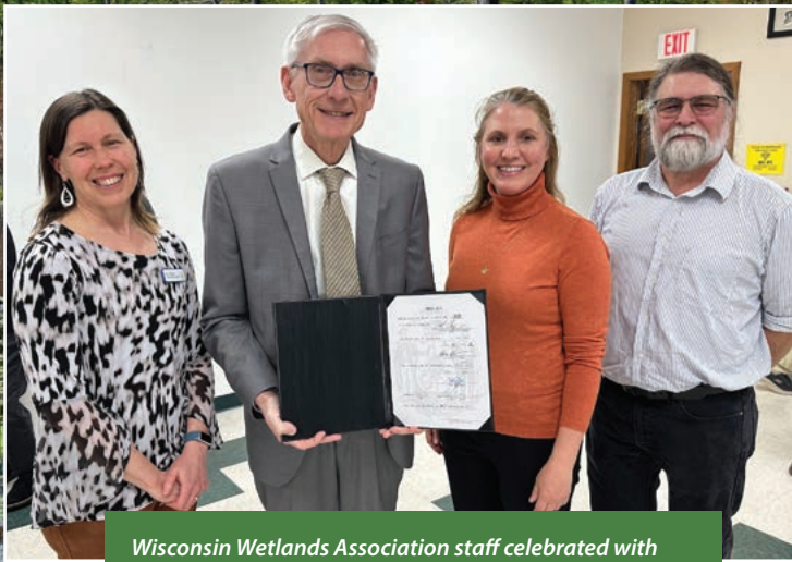
Wisconsin Wetlands Association staff celebrated with Governor Evers after he signed 2023 Act 265 into law.